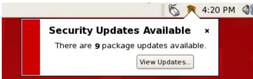
Figure 2.2. Package Updater Applet

Red Hat Enterprise Linux 5 features a running program on the graphical desktop panel that periodically checks for updates from the RHN or Satellite server and will alert users when a new update is available.